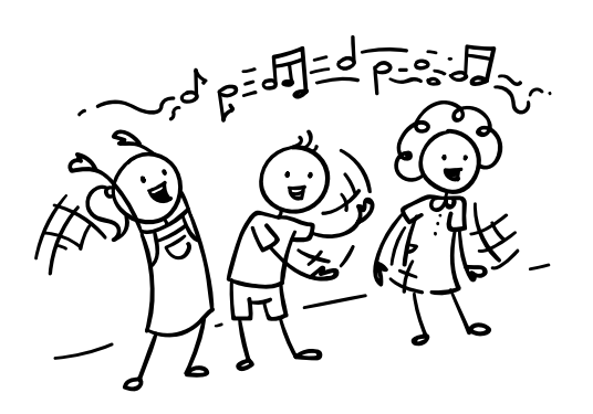
"The wheels on the bus Go round and round"