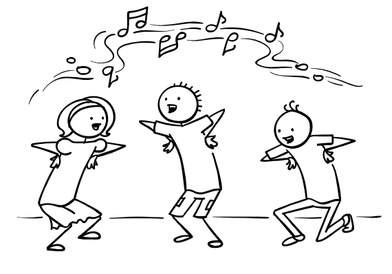
"I am a duck"