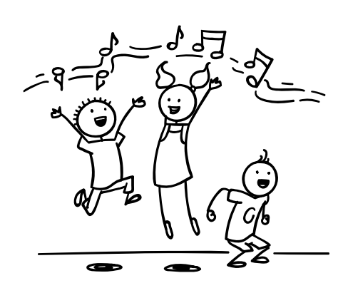
"Jump up and down"

The actions are very simple: as you sing along do the actions of the song.