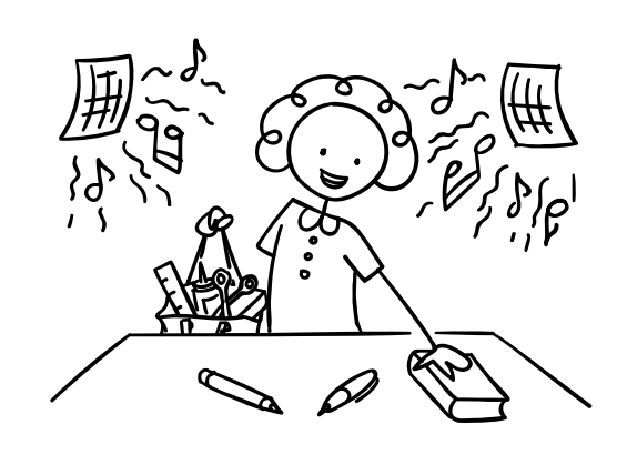
"Do you have a book?"