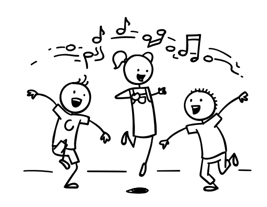
"Can you hop? I can hop! Hop, hop, hop, hop, hop, hop, hop, hop, hop, I can hop!"

The actions to this song are simple – simply do each action as they come up in the song. It's probably best for everyone to do the actions on the spot otherwise things could get a bit hectic!