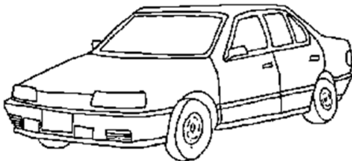
A yellow car