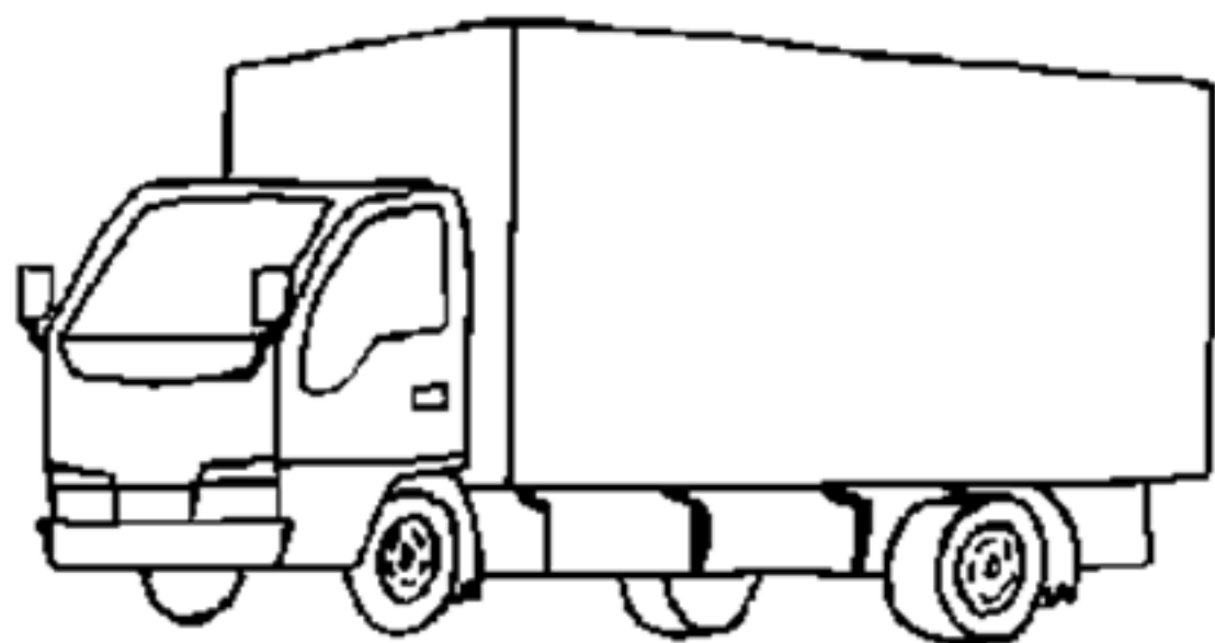
A red truck