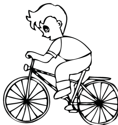
ride a bike